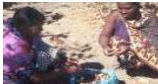
Peel and trim crops.