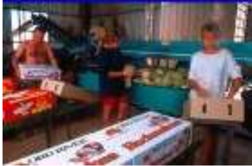
Package fruit and vegetables.

Task: Cut out the cards and rearrange them in the correct order, according to how we harvest crops.